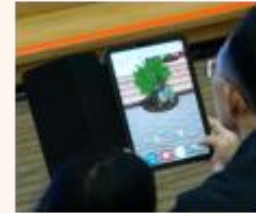
TL Digital Resource: AR Experience