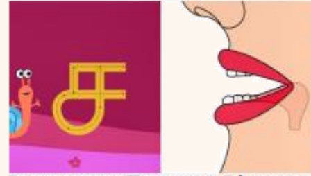
TL Digital Resource: Tongue Placement Videos