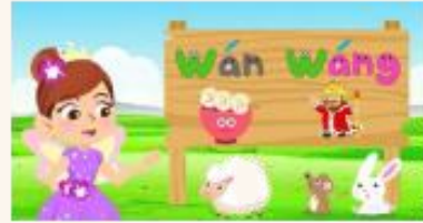
CL Digital Resource: Hanyu Pinyin Animation