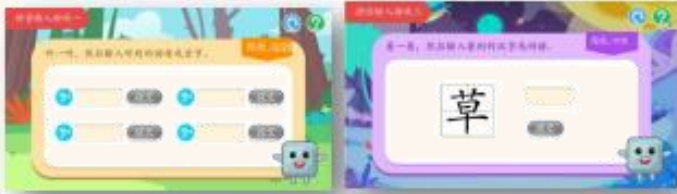
CL Digital Resource: Hanyu Pinyin Games