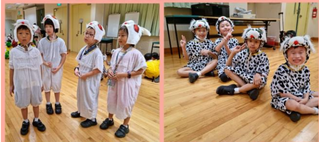
《 是谁嗯嗯在我的头上 》