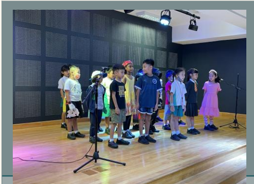
P1 ML SPEECH AND DRAMA