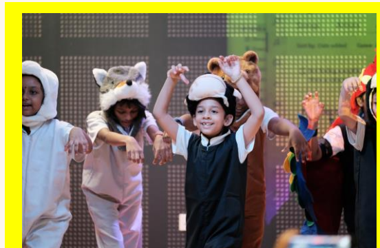
P1 TL SPEECH AND DRAMA