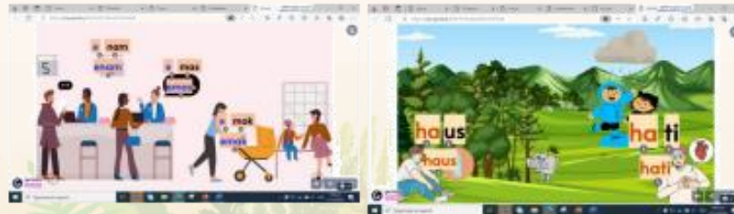
ML Digital Resource: Bridging Videos