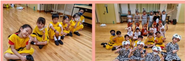
1CL3 SPEECH & DRAMA